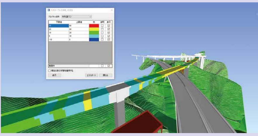
Screenshot from Navix+, CTC's software for managing architectural and construction-related 3D attributes

different positions, such as contractees or local residents. This is hoped to enhance the quality and safety of construction work.