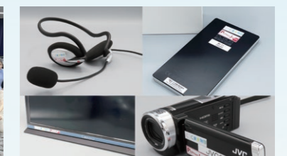
Grants to universities and other institutions for the purchase of equipment