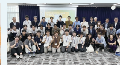
Scholarship student networking events